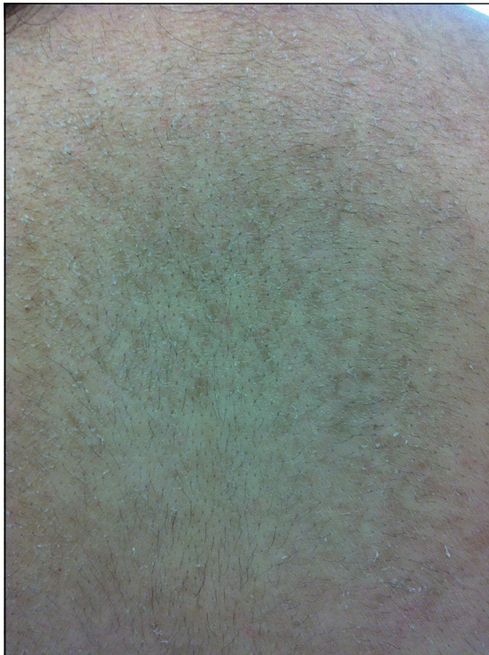
Figure 1. Axillary rash on presentation.